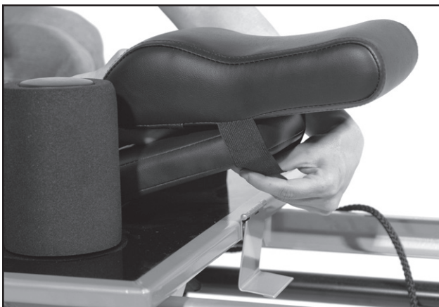
Placing pillow on headrest

With the headrest in the flat position, place the head and neck support pillow on top of the headrest with the thickest part of the head and neck support pillow nearest the carriage so the thickest part will be under your neck. Secure by slipping the elastic band around the headrest. Move the head and neck support pillow toward you or away from you until it is comfortable.